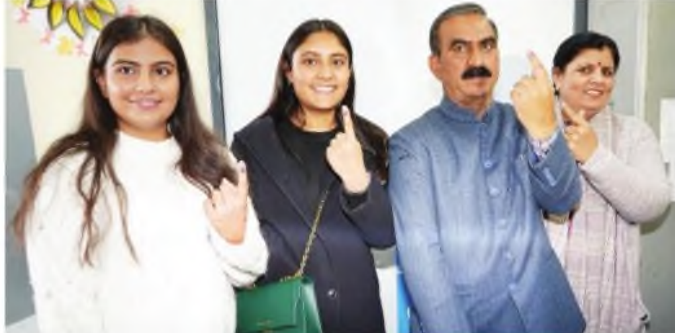
Himachal CM Thakur Sukhvinder Singh Sukhu with his family members after casting their votes.

For the 34 wards about 50 percent are reserved for